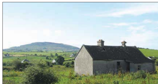
Restoration of derelict houses will be facilitated

Where it is proposed to replace or restore an existing dwelling house, the house to be replaced or restored should be clearly recognisable as a dwelling house. In any such case the essential characteristics of a house (i.e. external walls, roof, and openings) must be substantially intact and the structure, when last used, must have been used as a dwelling. In assessing the condition of such structures, the planning authority will disregard any recent structural works carried out as an attempt to comply with the above requirements.