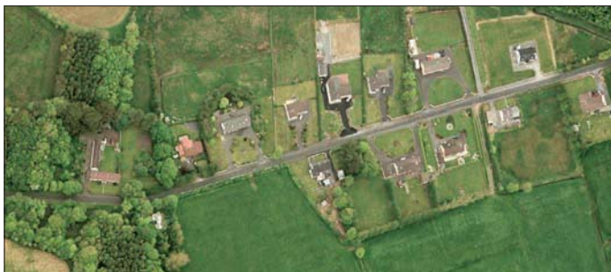
Ribbon development: frontage development along a road with no tandem development in the backlands

Ribbon development means frontage development along a road where there is no tandem development in the backlands, for example five or more houses on any one side of a given 250 metres of road. It is undesirable because it creates numerous accesses onto traffic routes, sterilises backlands, landlocks farmland, creates servicing problems (e.g. water supply, drainage, footpaths, street lighting) and intrudes on public views of the rural setting.