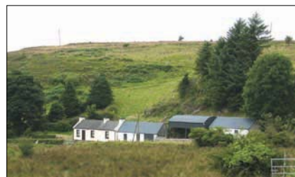
Traditionally, rural housing made use of trees, hedges, setbacks and natural contours for successful absorption

Urban sprawl means unplanned development expansion along the roads out of towns and villages, whether or not in ribbon form. It gives rise to the same problems associated with ribboning, but may have an even greater visual impact and transform the character of the adjacent settlement.