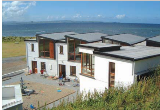
Holiday accommodation in Enniscrone

While the provision of such accommodation within existing settlements can contribute to the local economy, it might result in local people being priced out of the property market. It can also put increased pressure on local infrastructure. Therefore there is a need to ensure there is a sustainable balance between the number of holiday/second homes and the number of permanent residences. Ongoing monitoring of the supply of holiday homes will therefore be carried out by the planning authority in order to ensure that an appropriate balance is maintained.