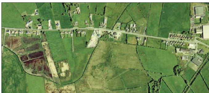
Urban sprawl: unplanned development expansion along the roads out of towns and villages